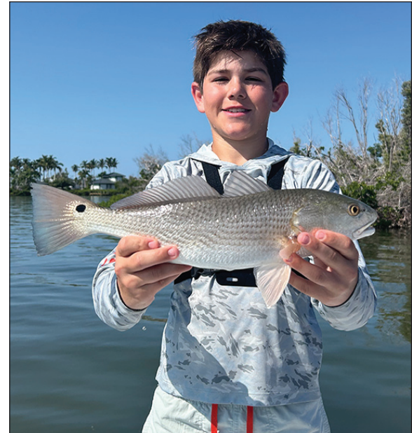
■ And a redfish too.