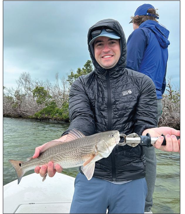
Lincoln Day with a redfish too.