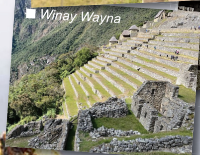
■ Winay Wayna