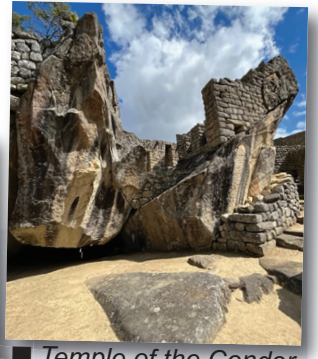
■ Temple of the Condor