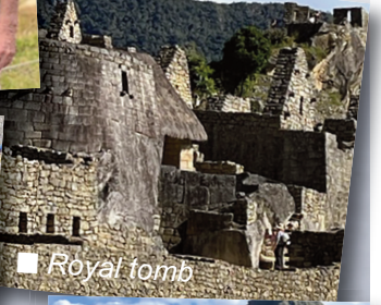
■ Royal tomb