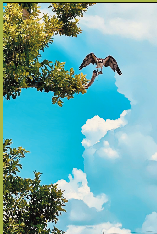
■ Summer in Boca Grande means lazy bees buzzing, amazing clouds over the Gulf, more anoles and other assorted lizards than you can shake a stick at, beautiful bougainvillea by the Catholic Church and ospreys that find a perfect feeding area against bright blue skies.