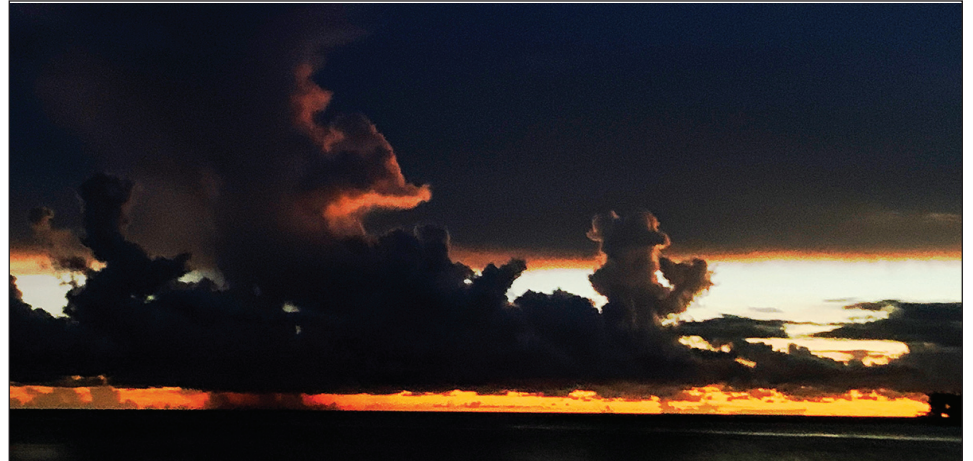
■ For those of you who have left the island for the summer, you are missing some crazy sights. Above, cotton candy skies are actually a more common sight than you might think, but the Halloween dragon and French poodle clouds that showed up just before dark on Tuesday night were more than amazing. Bottom right, a big cloudburst out in the Gulf at sunset just touched land, then headed toward Englewood. Below right, another unusual sight this week was a Charlotte County helicopter casually tracking over Gasparilla Sound with someone dangling from a rope. Just another day of training of the newbies at CCSO, apparently. Bottom left, a large amount of century plants are blooming on the island right now.