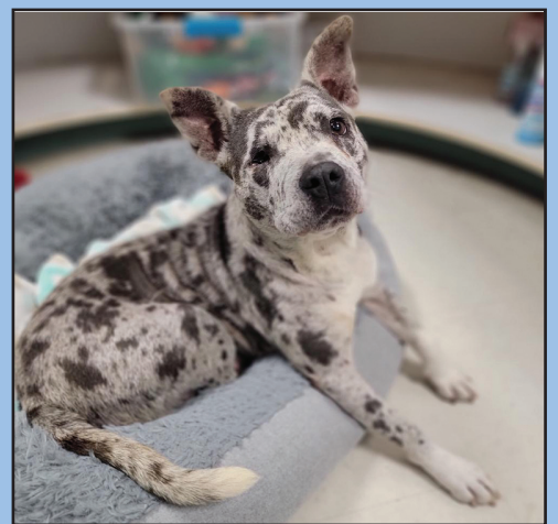
Twinkie is the sweetest pup! She's always wagging that tail of hers and just as happy as she can be! Twinkie is a real lover and craves affection. She's just a year old and all she wants to do is curl up and snuggle with you on your couch or bed. Ready to come meet this adorable girl?