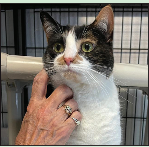
Cali desperately needs a fur-ever home or a foster. She's been at the shelter for almost a year and while we all love her, we want what's best for her. She's 4 years old and is a beautiful Calico. She's a bit of regal lady and will play occasionally, but mostly enjoys laying around and just being