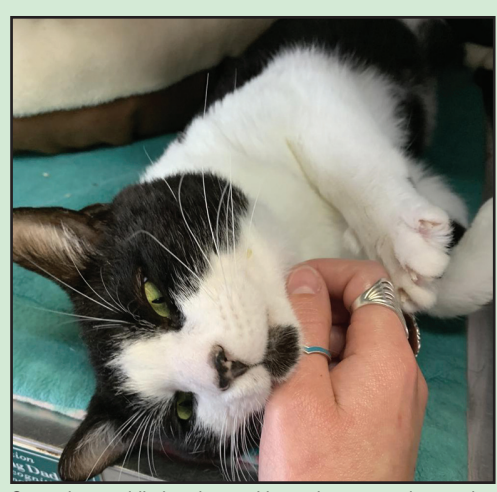
Cyrus is a cuddle bug just waiting to be scooped up and loved on! This silly 1- year-old boy loves to get belly rubs and chin scratches. He's affectionate and playful and will make some lucky person very happy one day. Is that person you?